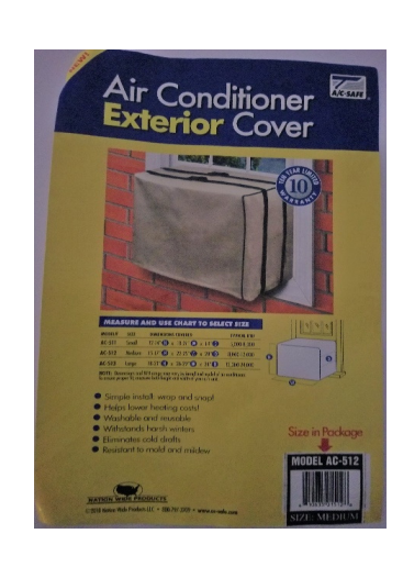
actual color below: beige